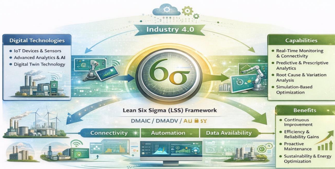
Figure 3. Integrated conceptual framework linking Lean Six Sigma, digital technologies, and sustainability in energy systems

Figure 3 presents an integrated conceptual framework showing how Lean Six Sigma can be strengthened through digital technologies in modern energy systems. The framework links core Lean Six Sigma functions, such as process control, root-cause analysis, and continuous improvement, with enabling digital technologies including IoT, advanced sensors, artificial intelligence, real-time analytics, and digital twins. These digital enablers improve visibility, prediction, responsiveness, and process optimisation, thereby reinforcing both operational performance and sustainability outcomes. The figure is therefore intended to summarise the recurrent themes identified in the reviewed literature rather than to serve as a purely abstract conceptual model.