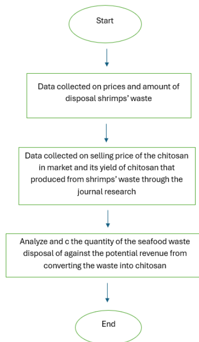
Figure 3. Research process

Lastly, the analyze and comparison is made on the disposing amount of seafood wastes and the potential earnings from converting the seafood waste into chitosan. The revenue had been calculated based on the yield of chitosan that can be produced from the shrimps' waste and the market price of chitosan (Brand: RunJie). Refer to Figure 3.