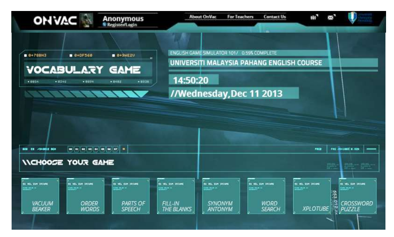
Figure 1. Screenshot of OnVac's main page

which include Vacuum-beaker, Order-Words, Parts of Speech, Fill-in-the-blanks, Synonym-Antonym, Word Search, XPlotube and Crossword Puzzle.