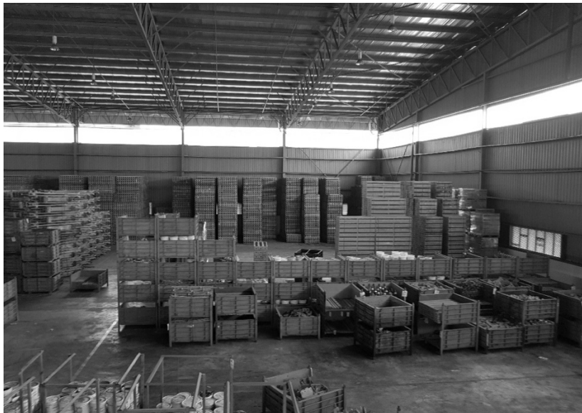
Figure 3. A warehouse in an organised manner using WMS

ABC Company is in a favourable way by enhancing its information handling processes. Companies can acquire, store, and evaluate important information about their business activities with a WMS in place. This can assist them make informed decisions regarding their firm. The programme also integrates easily with already-in-use processes and systems. First off, a warehouse management system may assist a company in cutting operating costs. If employees are able to employ a WMS to determine the best spots for items, supplies, and devices, operational costs for a storage facility are reduced. Increased inventory visibility may result in less immediately stock being kept on hand by a company. A business