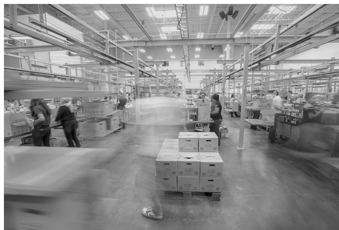
Figure 1. A stressful and hectic warehouse without a WMS being introduced

The business-to-business sector's current warehouse management systems sometimes have trouble handling high-volume order processing, which leads to delays, errors, and higher operational expenses. The goal of this study is to create a reliable and expandable warehouse management system that makes use of automation, advanced analytics, and customer fulfilment to increase operational efficiency and inventory correctness in business-to-business warehouses. The warehouses of every business or link in the supply chain are essential. After carefully weighing the relevant business issue, it is necessary to take this action. Lacking a warehouse management strategy in the business made warehouse activity chaotic. Due to a lack of precise and current information on the stock level of its carton boxes, the company has inefficiencies beyond having an inadequate or excessive amount of stock in its warehouse. This increases the risk of buying inaccurate goods from suppliers or selling false merchandise.