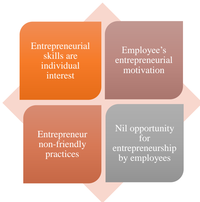
Figure 2 : The themes emerge from the findings of the study

In discussing the first theme, entrepreneurial skills are individual interest, Employer 7 argued that the interest to involve in entrepreneurship rest on the graduates themselves. He asserted: “If you were to ask about entrepreneurial skills of the Islamic college graduates, I believe that involving in the field is up to themselves” . He added that entrepreneurial skills were added values viewing that the nature of the organisation in which the graduate was employed did not require such skills. He said, “... having entrepreneurial skills may add value to your ability in doing your jobs. But here, as a religious officer, honesty, sincerity is more important [than the skills]” . Nevertheless, he admitted that they were employees in other departments that were involved in business. He claimed, “... there are three to four personnels in that department [pointing to other departments in the organization] involve in business. For instance, they are some of them who sell prepaid top-up, clothes, and a lot more.