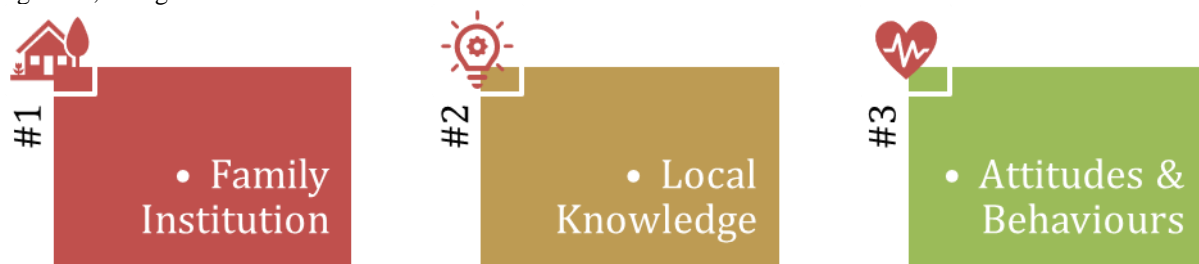
Figure 2. Three core themes emerging from the study.

As aforementioned, this research project employed two qualitative instruments to collect 'thick' data namely interviews and focus group discussions. These were conducted with participants from the selected research sites consisting pre-diploma and diploma students in the state of Perak, Malaysia. All of the participants are from the Semai ethnic background, living in the state of Perak.