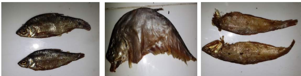
(a) Punti ( Puntius sophore ) shidal