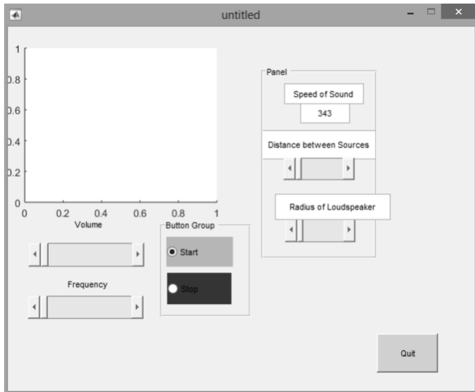
Figure 3 Example of button at layout area for GUI.

demonstration. In this experiment, MATLAB®-based Graphical User Interface (GUI) was developed to complete the modelled tube as shown in Figure 3. This model consisted of various dimensions such as tube radius, hole spacing, number, size, etc. Also, the presence of the loudspeaker affected the result. This was due to the loudspeaker changing the resonance frequencies and effected the result during the first few harmonics. The loudspeaker itself had its own resonant frequency and introduced a significant damping to the system.